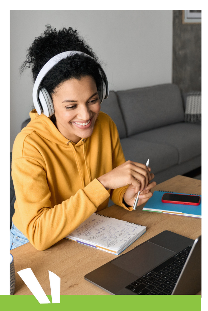
<u>Contact us</u> to empower your team to thrive in the green economy.